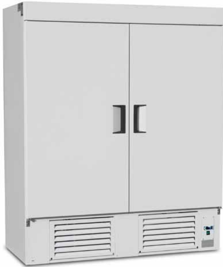
I-Ola P Gastro*